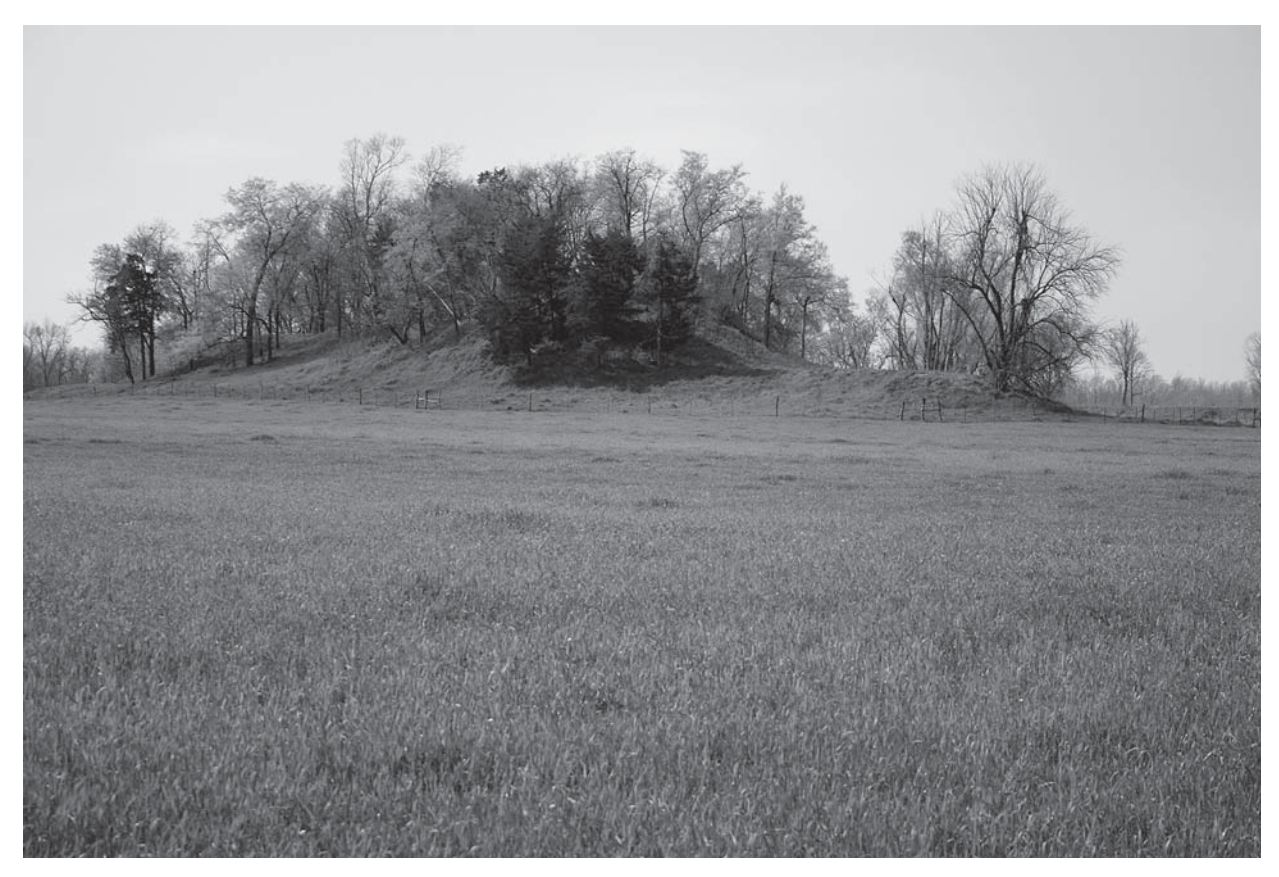
Figure 29. The Battle Mound at the time of the 2007 Caddo Conference.

There was a tour on Sunday morning of both the Crenshaw site and Battle Mound (Figure 29), allowing many of the Caddo to visit these large multiple mound sites for the first time. Several were able to obtain small branches from cedar trees to take home.