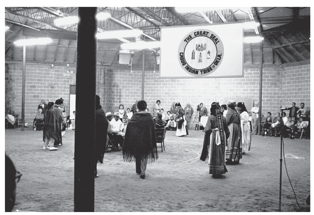
Figure 1. Caddo dancers, entertaining the archeologists at the Caddo Cultural Center in Binger, Oklahoma, Twenty-seventh Caddo Conference.