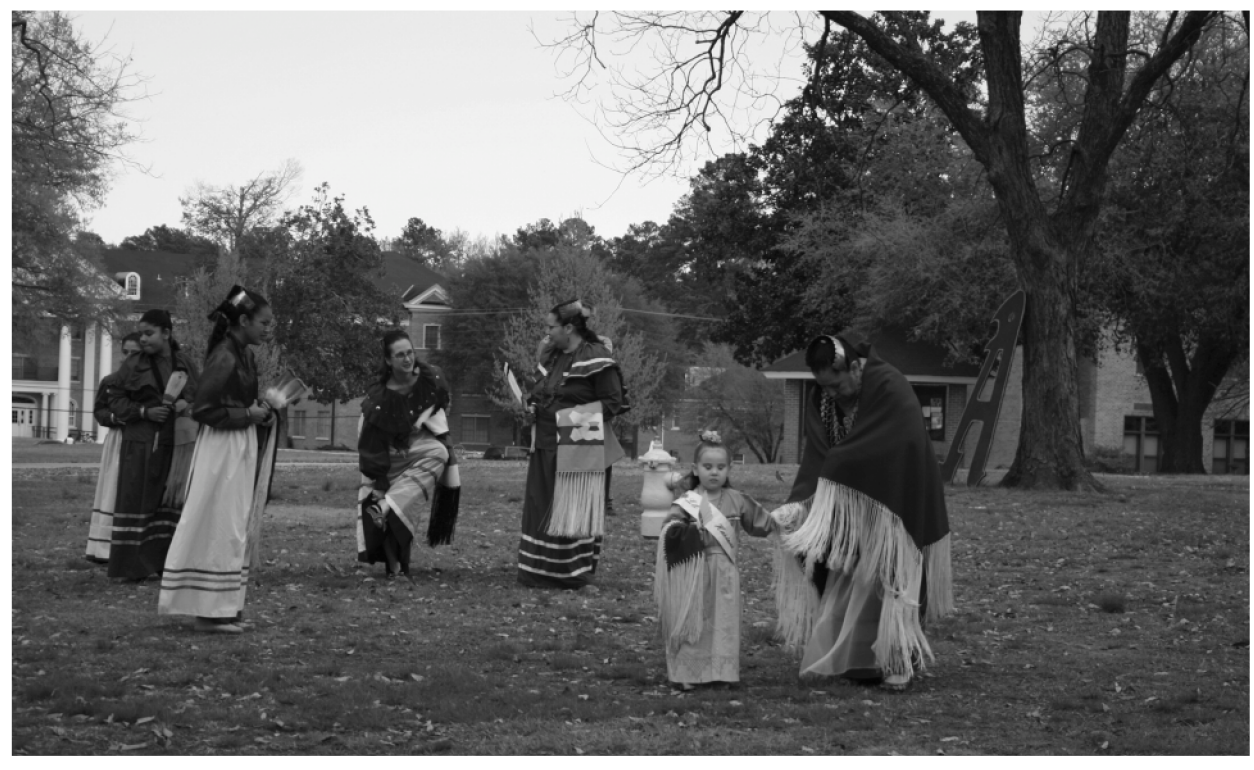
Figure 28. Caddo women dancers at the Forty-ninth Caddo Conference in Magnolia.