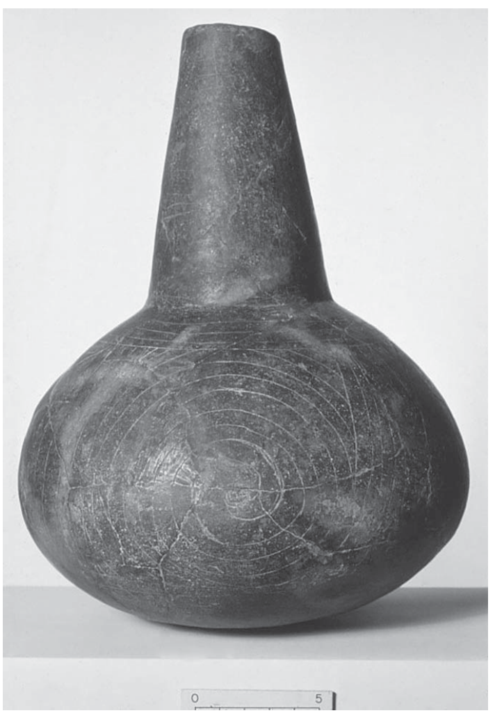
Figure 9. Spiro Engraved bottle from the Eureka Mound site in southwest Missouri.